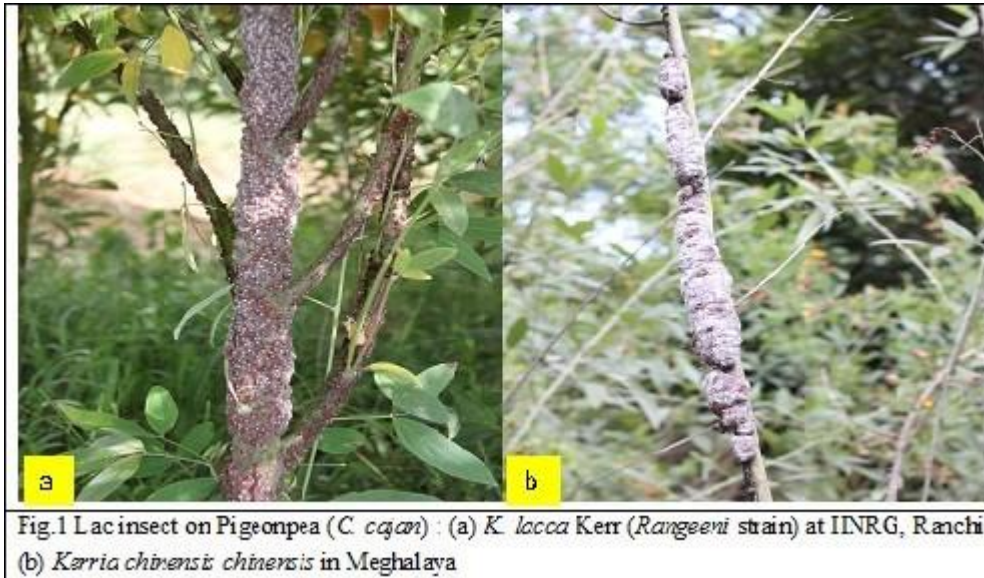
Fig.1 Lac insect on Pigeonpea ( C. cajan ): (a) K. lacca Kerr ( Rangeeni strain) at IINRG, Ranchi; (b) Kerria chinensis chinensis in Meghalaya

production giving increased remuneration to the farmers. Hence, the present study was planned to investigate the effect of lac cultivation on seeds quality of different pigeonpea germplasm.